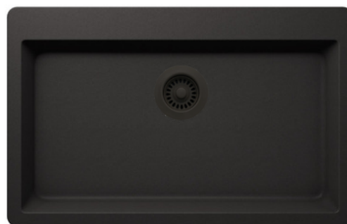
Color Pictured: Gunmetal *Pictured with Matching Gunmetal Strainer